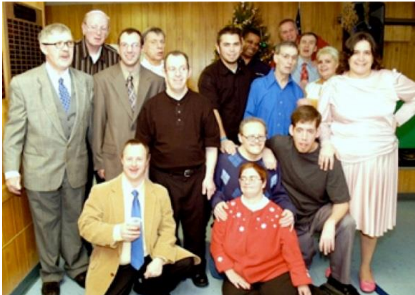
Consumer Quality Council, Fitzmaurice Community Services, Stroudsburg, PA

Members reflect on what stands out to them. Some members note significant changes in improved outcomes, a few are drawn to areas where performance is not improving, and others focus on performance that is on par with the state and national levels but is still below what should be.